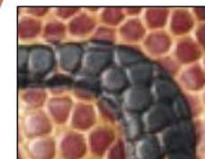
After 30,000 Bounces