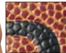
NEW TF-1000 ZK PRO